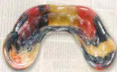
PLAYSAFE SPORTS MOUTHGUARD